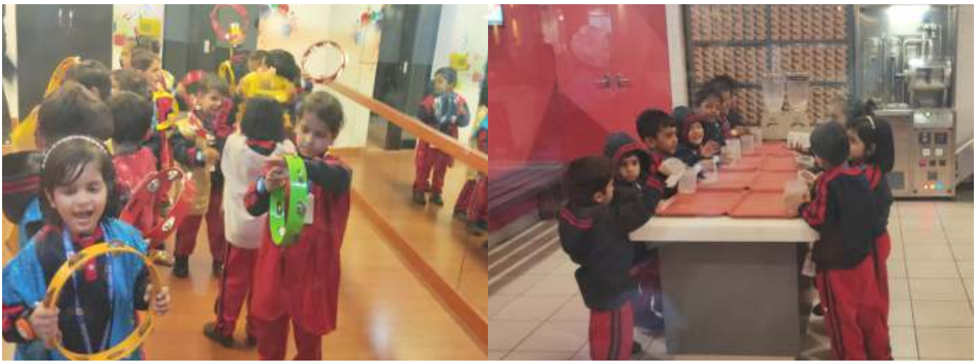
Preparing to be filmed for a group dance