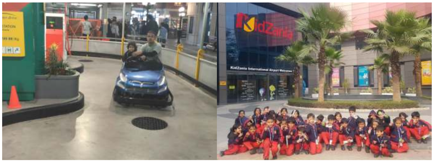
I learnt to wait for my turn while filling fuel in my car

The students of the KG Department visited KIDZANIA in December, an Indoor Entertainment and Learning Centre. What they experienced there was unique and related to real world activities. These experiences help to build their social skills and instill confidence. Above all, the KIDS HADABLAST.