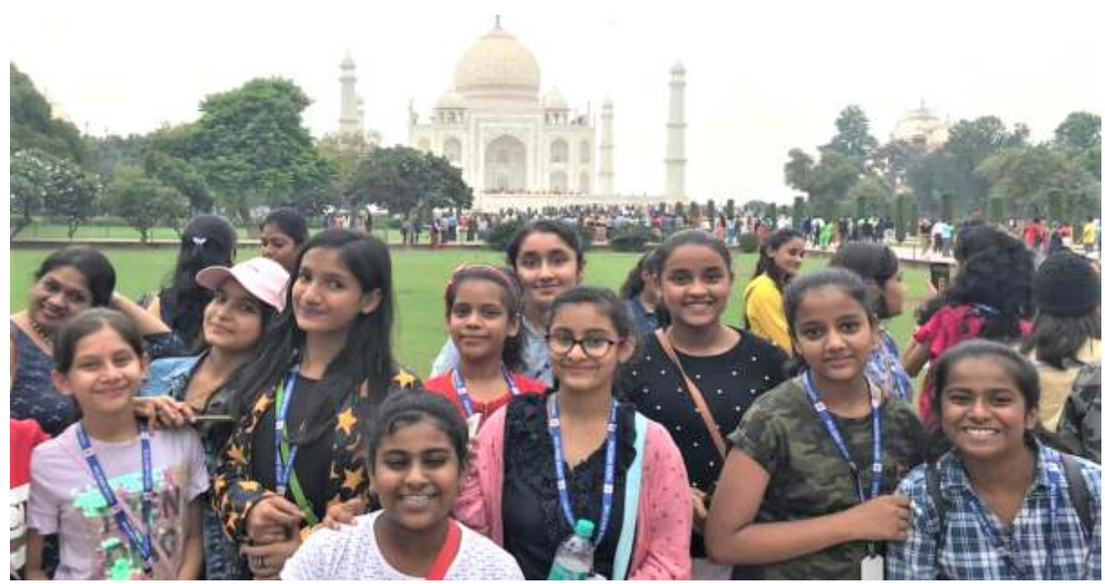
The Taj Mahal at Sunrise