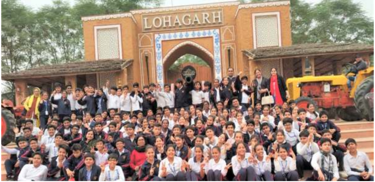
Enjoying rural experiences at Lohagarh Farms