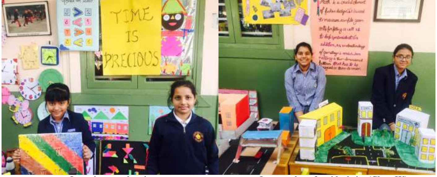
Learning to value time