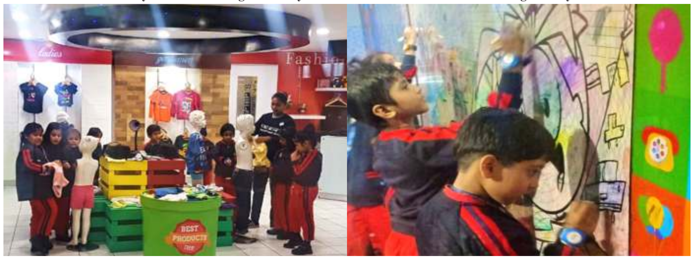
We learnt how mannequins are dressed and how clothes are sold in Malls